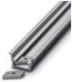
DIN rail, deep drawn, high profile, unperforated, 1.5 mm thick, material: aluminum, height 15 mm, width 35 mm, length 2000 mm

DIN rail, unperforated - NS 35/15 AL UNPERF 2000MM - 1201756