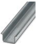
DIN rail, material: Galvanized, unperforated, height 15 mm, width 35 mm, length: 2 m

DIN rail, unperforated - NS 35/15 ZN UNPERF 2000MM - 1206586