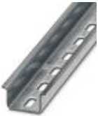
DIN rail, material: Galvanized, perforated, height 15 mm, width 35 mm, length: 2 m

DIN rail perforated - NS 35/15 ZN PERF 2000MM - 1206599