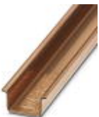
DIN rail, material: Copper, unperforated, 1.5 mm thick, height 15 mm, width 35 mm, length: 2 m

DIN rail, unperforated - NS 35/15 CU UNPERF 2000MM - 1201895